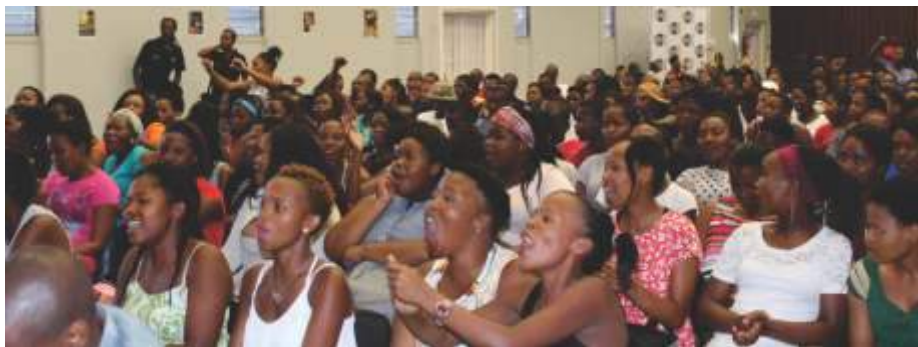
Pictured: Students at the Midlands Campus's enjoying Orientation.day.