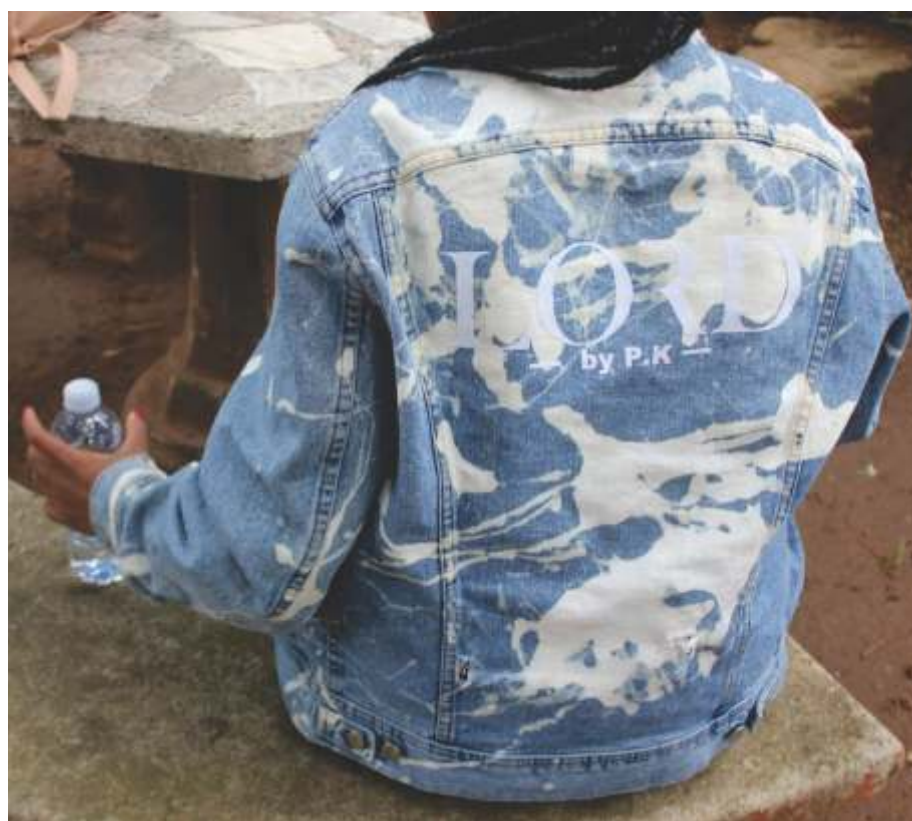
A designer denim jacket with a DIY design.

Denim dresses are very trendy these days and they will never be out of fashion. For day to day casual looks, denim outfits are a favourite choice for every woman. Simbonge and Nomfundo both Town Planning first year students are rock their denim dresses. You go girls!