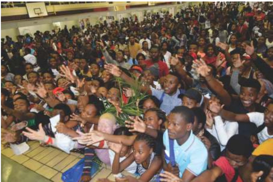
Pictured: Happy students filled DUT's Sports Centre in excitement.

At Durban, DUT's Sports Centre at Steve Biko Campus it was filled to capacity with jovial students. Both Midlands and Durban Campuses worked tirelessly around the clock aiming to assist students in feeling at home while they are away from their parents and homes.